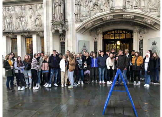
Debate Day - Supreme Court Visit to the Supreme