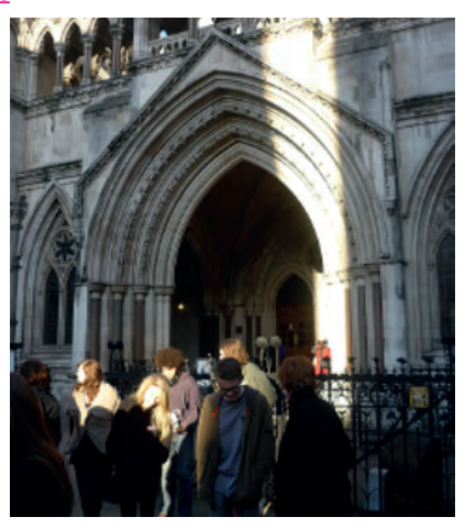
Outside Royal Courts of Justice

Examined: 2 hour exam: 2 short answer questions, 1 essay and a scenario question.