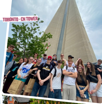
TORONTO - CN TOWER

Students also made their usual local field excursions to the Sussex coast and Lewes. Overall, a great summer of outdoor learning in the Geography and Environmental department.