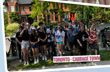
TORONTO - CABBAGE TOWN