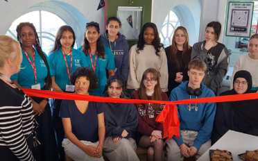
VARNDEAN'S NEW LEGAL HUB