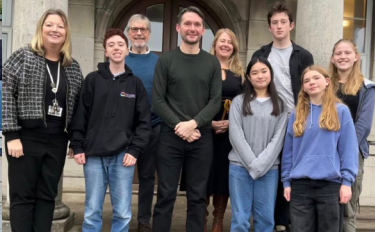
STUDENTS CHALLENGE LABOUR MP